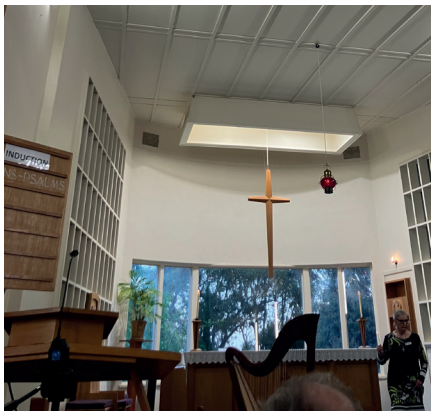
Altar and pulpit at St Peter's on the Lake.