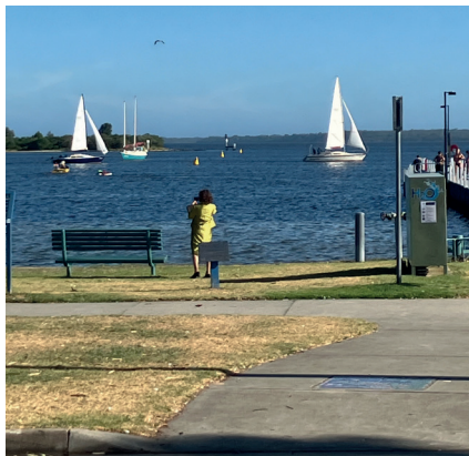
Looking over the water from the restaurant.