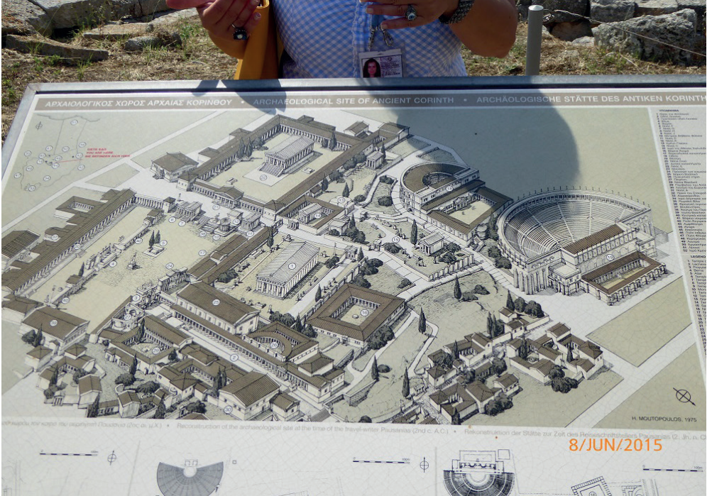
Archaeological Site of Ancient Corinth