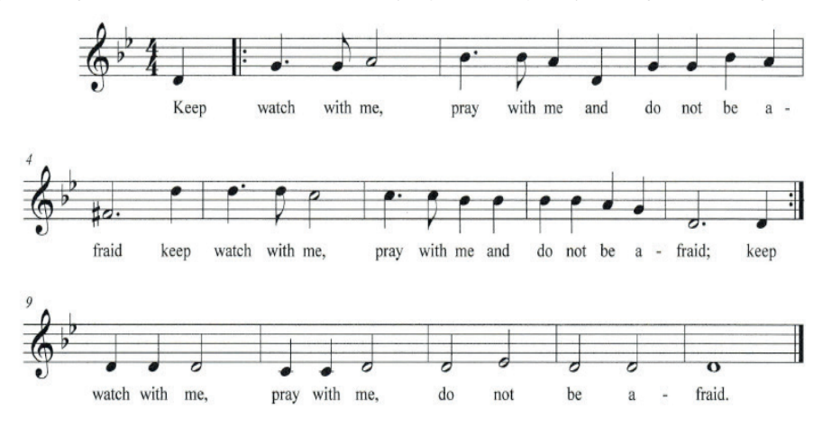
You are welcome to stay and keep The Watch. Compline will follow after a brief time.

<u>After</u> the lights are dimmed and when the Table of Repose is ready, the following chant is sung: